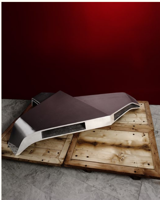
CLOCKWISE FROM LEFT, 'DCJ TABLE' BY VINCENZO DE COTIIS, SPONSORED BY JAGUAR, INSPIRED BY JAGUAR DESIGN