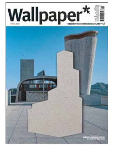
April 2013 issue on sale now